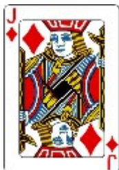
Snoop's Planetary Ruling Card

Jack of Diamonds as one of your Alternate Ruling Cards